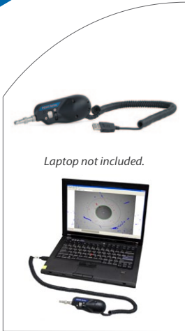
AUTOMATED INSPECTION AND ANALYSIS