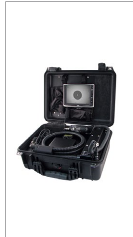
ADVANCED INSPECTION AND CLEANING