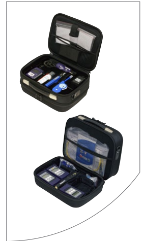
APPLICATION-SPECIFIC INSPECTION AND TEST