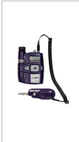
INTEGRATED INSPECTION AND TEST