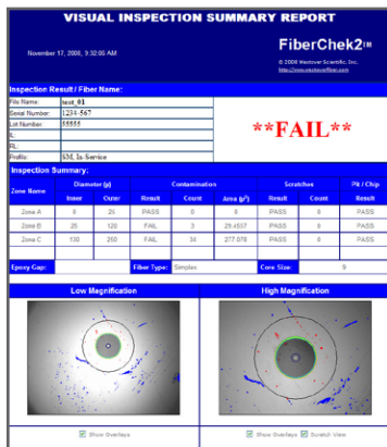
FiberChek2 Analysis Summary Report