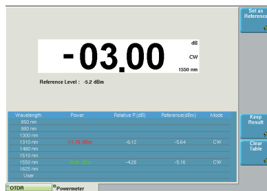
Figure 2: Jumper loss measurement