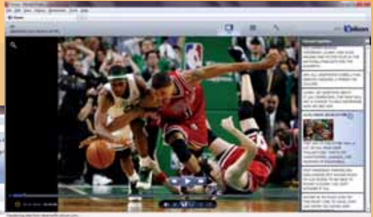
Closed caption text display window