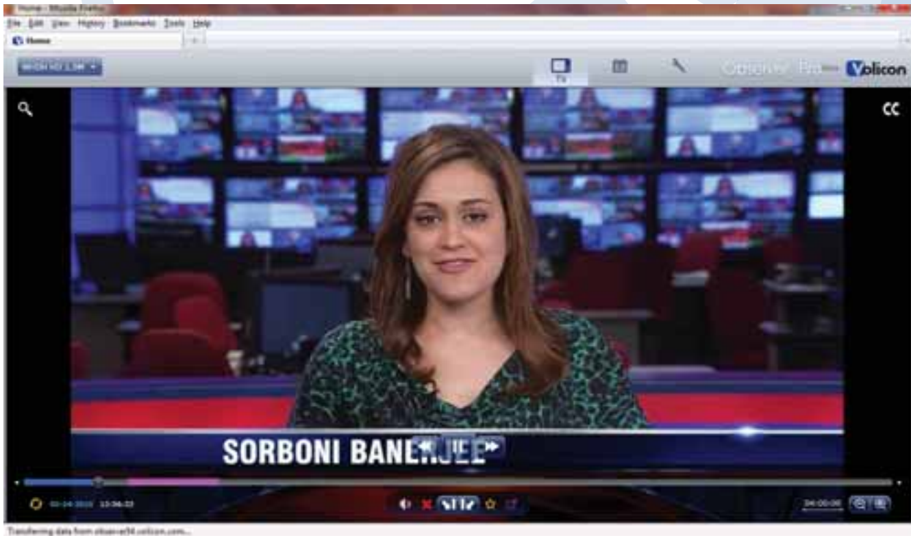
Home page for Observer Professional

The Observer Professional also features the latest enhancements to the Observer's search capabilities, including both simple and advanced search queries, auto-complete search of closed-captioned text, sub-clips, or programs along with an intuitive navigation workflow to find content quickly and efficiently. The Observer Professional supports one to four channel inputs and up to ten concurrent users, and offers up to 90 days of storage for SD Analog archived video. In addition, the Observer Professional includes a revamped electronic programming guide (EPG)-based Scheduled Recording Module for scheduled, selective recording of specific broadcast channels within designated time periods.