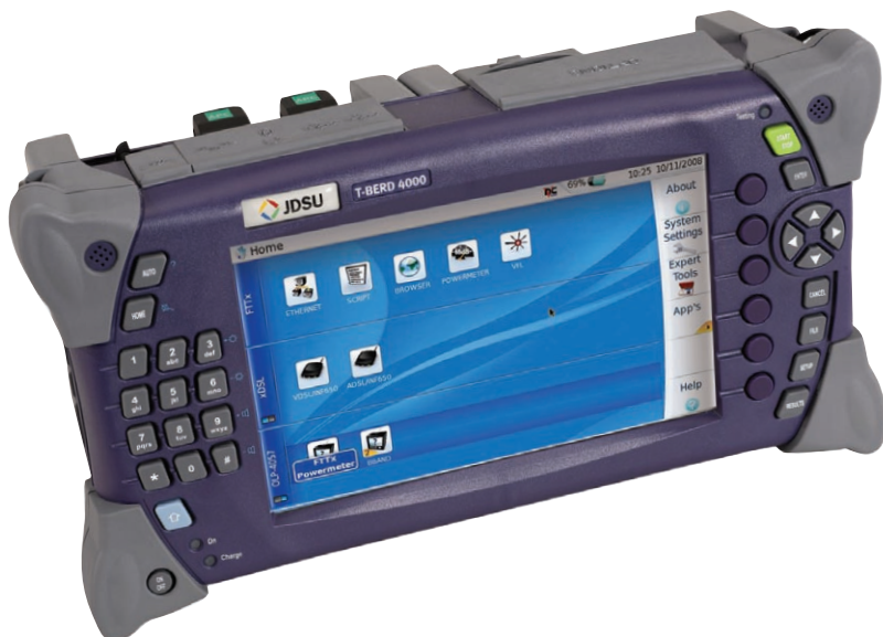
The JDSU T-BERD/MTS-4000 is the industry's first combined fiber, copper, and triple-play tester.